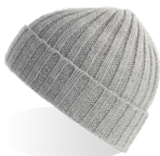
light grey mel