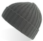
dark grey mel