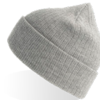
light grey mel