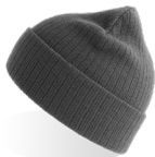
dark grey mel